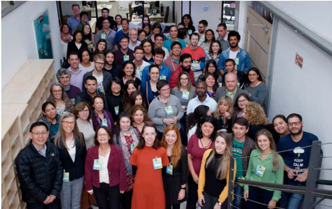
Participants of the Advanced School and Workshop on American Monsoons: Progress and Future Plans