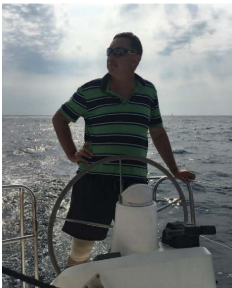
Sailing in Croatia

And let me conclude with some few informal words. Being of mountainous origin, I like nature and travelling. I also like enjoying life, with good food and drinks and nice people around. I still do my best to do some sports, after an active sportive career in childhood. I like skiing in the Alps, and my present favourite hobby is sailing (in particular in beautiful Croatia). As a result of my rather active career, both in terms of research and service to the community, I feel I can use my expertise and experience as an IUGG Bureau member. I am looking forward very much to this stage and to cooperation with all IUGG Executive Committee Members.