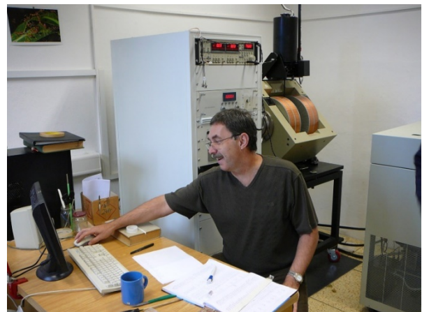
Measuring magnetic properties of rocks

I was born and grew up in the High Tatras mountains in northern Slovakia (former Czechoslovakia). My father worked for some years at the Lomnický Peak astronomical observatory and was involved in design and construction of instruments for recording cosmic rays. He was the first Slovak who spent a full winter at the Soviet Mirnyi base in Antarctica in 1962-63. Maybe I inherited from him the bias for exact natural sciences and graduated in solid state physics at the Faculty of Natural Sciences of Safarik University in Kosice. However, due to political activities and the attitude of my father during the “Prague Spring” upheaval in 1968, our family was black-listed and I was aware of possible troubles in making a professional career. Therefore, I decided to move to Prague, more than 600 km away from my home. Despite that, my career was affected politically and I was not allowed to start a PhD until the revolution in 1989. Nevertheless, I started my professional career at the Institute of Geophysics (present Czech Academy of Sciences) in Prague where I work until now. My first steps were in paleomagnetism, but later I switched to the newly emerging field of environmental magnetism. This is, simply speaking, the application of the knowledge