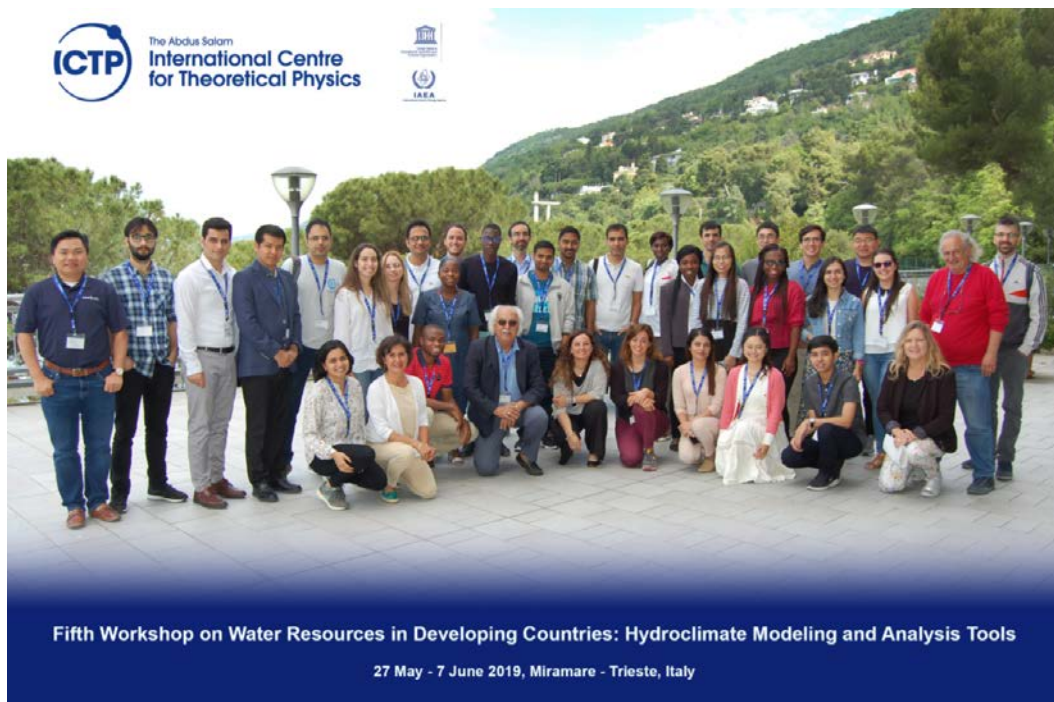
Participants of the Fifth Workshop on Water Resources in Developing Countries: Hydroclimate Modelling and Analysis Tools