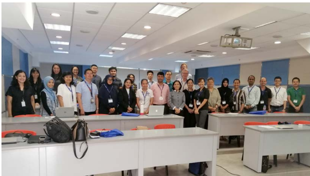
Participants of the Workshop on Distilling Climate Information for Sectoral Applications