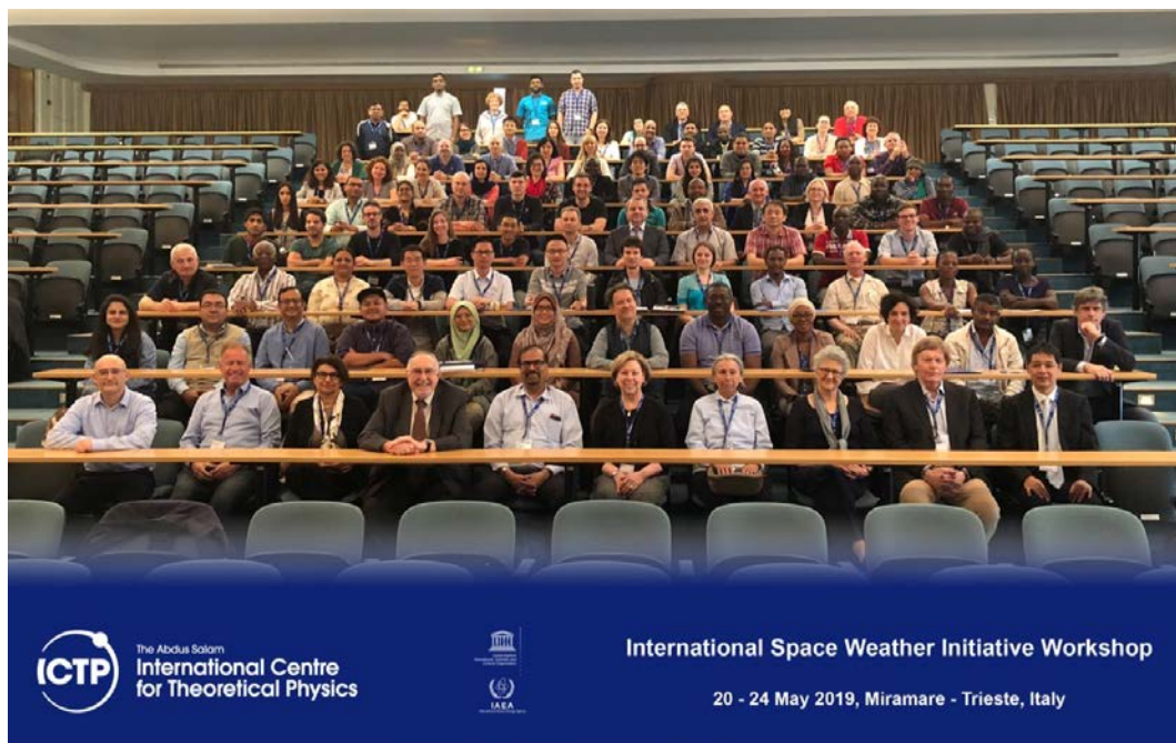
Participants of the International Space Weather Initiative Workshop