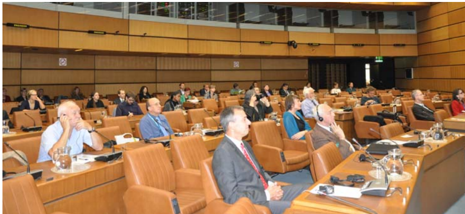
The launch of the VALID booklet