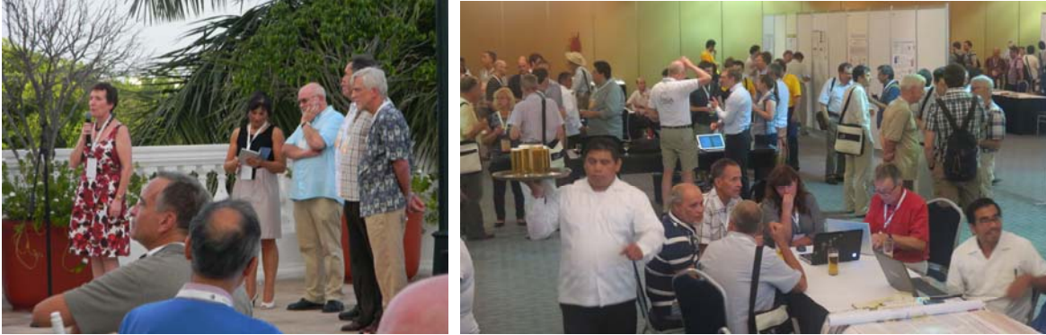
Award & Opening Ceremony (left) and poster session (right).