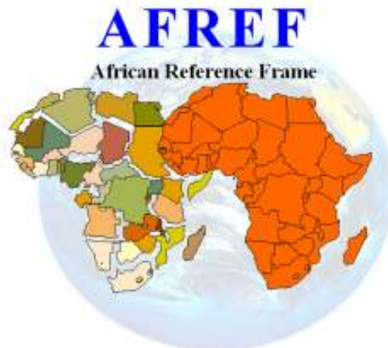
Figure 2: AFREF logo launched at the technical workshop held in July 2006

Although the ideals and concepts of AFREF have been debated for a number of years, the scientific and technical aspects of the project had never been highlighted in a dedicated workshop. The possibility of South Africa hosting such a technical workshop was raised at a United Nations Office for Outer Space Affairs (UNOOSA) meeting in Vienna in December 2004. A small Local Organising Committee was constituted and the University of Cape Town was selected as the most appropriate venue. The workshop was initially planned for January / February 2006 but, because of insufficient funding at the time, was postponed to July 2006. The University of Cape Town and the Chief Directorate: Surveying and Mapping jointly organised the first AFREF Technical Workshop in July 2006, relating to the establishment of the African Geodetic Reference Frame. Delegates from 24 countries attended. 38 representatives from 17 countries with a good geographical distribution throughout Africa were represented at the workshop. 4 representatives from 2 of the 3 regional centres for mapping in Africa also participated in the workshop viz. the Regional Centre for Mapping of Resources for Development (RCMRD) based in Kenya and the Regional Centre for Training in Aerospace Surveys (RECTAS) based in Nigeria. In addition to the above representatives from Africa, 15 speakers from a number of organisations outside of Africa gave presentations.