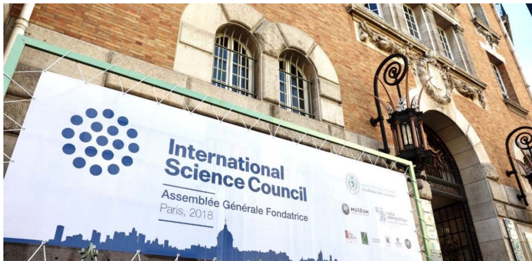
Maison des Océans, the venue of the inaugural ISC General Assembly

On 4 July 2018, the International Council for Science (ICSU) and the International Social Science Council (ISSC) merged to form the International Science Council (ISC), a unique global non-governmental scientific organization representing both the natural and social sciences, bringing together 141 Member Organizations (national and regional academies, research councils), 39 Member Unions and Associations (international scientific organizations), and 29 Affiliated Members. The ISC