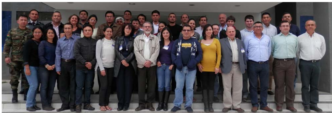
Attendees of the SIRGAS School on Vertical Reference Systems. La Paz, Bolivia, 20-22 November

The current activities, advances, and new challenges of SIRGAS are reported, discussed, and re-oriented (if required) in the annual SIRGAS Meetings, which have been held since 1993. In this series, the Symposium SIRGAS 2014 took place in La Paz, Bolivia from 24 to 26 November 2014. In the days prior to the Symposium (from 20 to 22 November), a SIRGAS School on Vertical Reference Systems was held. Both events were hosted by the Instituto Geográfico Militar of Bolivia.