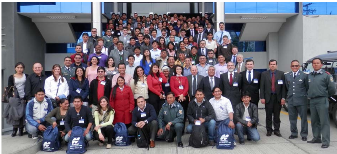
Attendees of the Symposium SIRGAS2014. La Paz, Bolivia, 24-26 November

The Symposium SIRGAS 2014 was attended by 260 participants from 19 countries (in addition to the School participants, Dominican Republic, Germany, Honduras, Mexico, Puerto Rico, and USA). In 39 oral presentations and 24 posters, the following topics were presented: Gravity and geoid modelling in the SIRGAS region, developments related to vertical reference systems and frames, geodetic estimation of geophysical parameters, report of the SIRGAS reference frame analysis centres, national reference frames and related applications, geodetic modelling of the Earth's crust deformations (in particular in the Andean orogeny), and practical usability of the SIRGAS reference frame. Presentations and extended abstracts of the contributions are available at the SIRGAS web site ( www.sirgas.org ).