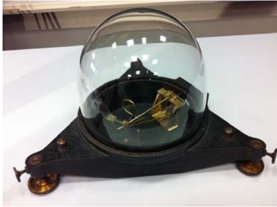
Original Rebeur-Paschwitz Horizontal Pendulum, which recorded the 1889 earthquake in Japan (Frechet and Rivera, 2012)