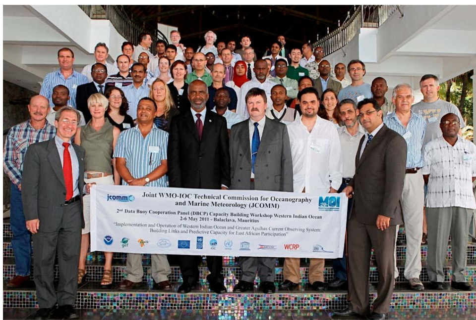
Meeting participants

The SCOR/IAPSO workshop “Towards an Observing System for the Greater Agulhas System: Building Links and Capacity for East African participation” was held in Mauritius, 21-25 March 2011.